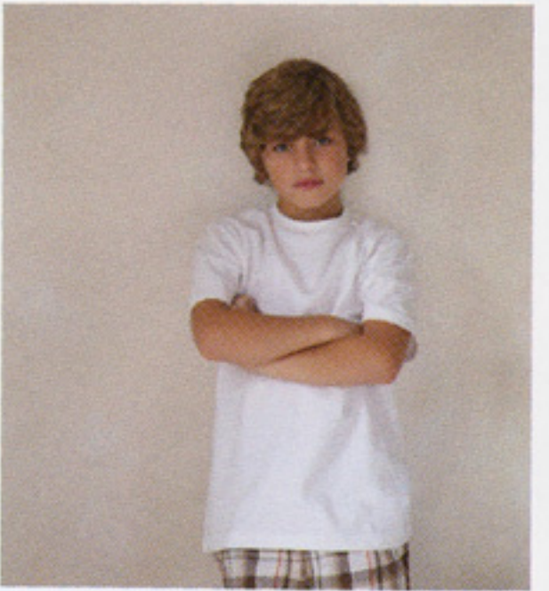
Age 9 (to 12) searching