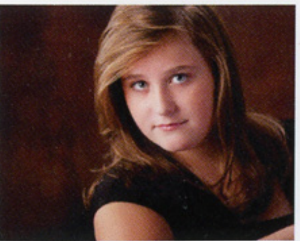
Age 13 (to 15) previews of promise