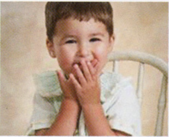
Age 3 ready to meet the world