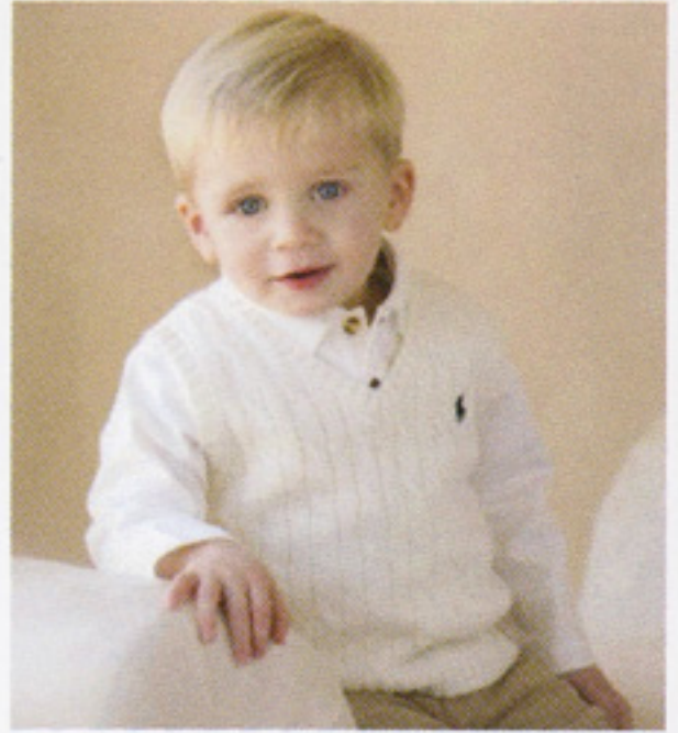
Age 2 an age of many moods