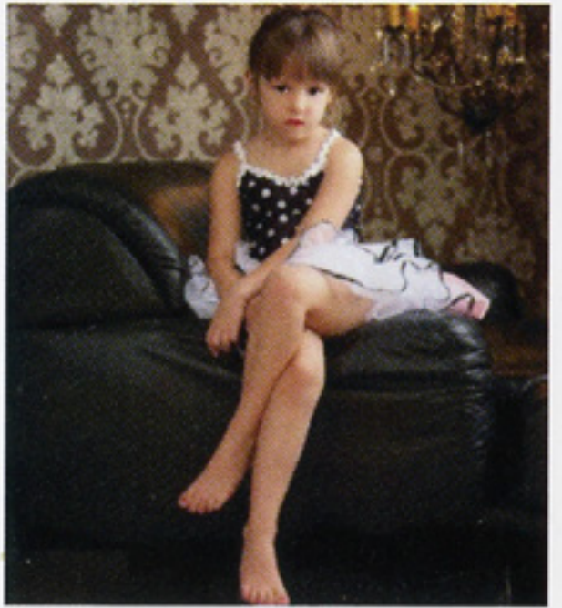
Age 4 (to 5) attitude and interests