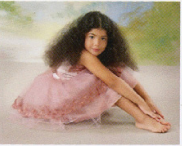
Age 6 (to 8) milestones and passions