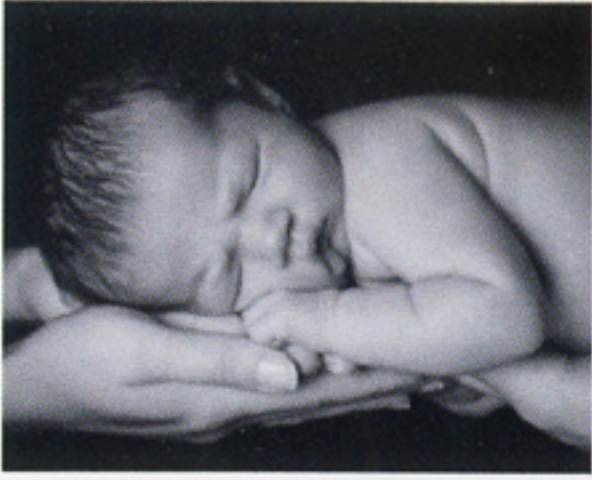
First Year a time when changes occur week by week